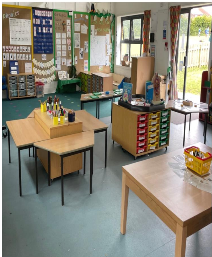
Oak Classroom (Reception base)