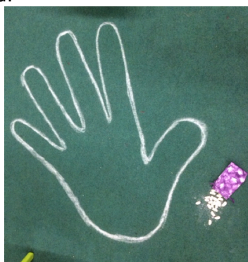
Whose hand and beans?