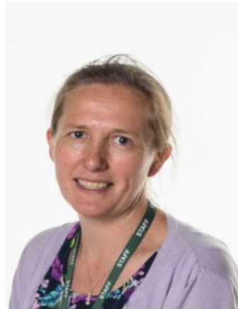
Foundation Stage Leader