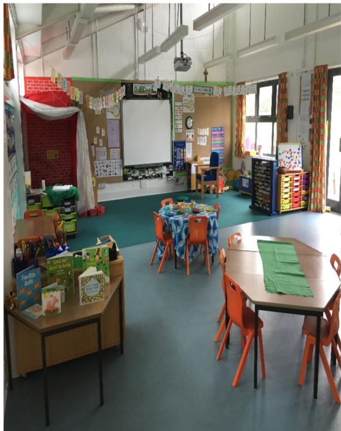
Oak Classroom (Reception base)