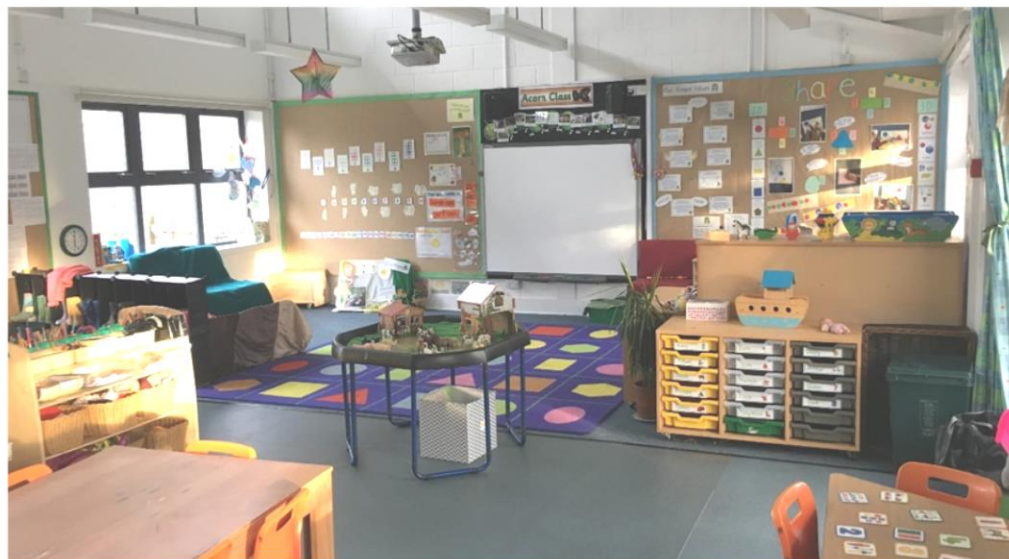
Acorn Classroom (Nursery base)