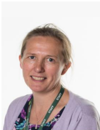
Foundation Stage Leader